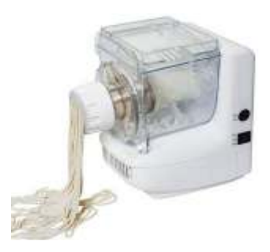
Fig. 5: Household noodle maker