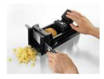
Fig. 4: Fruit and vegetable slicer

Many wineries still take over the method of manufacturing storage wine can with the carbon steel smeared with epoxy resin or pig blood. Although the cost is low, the influence on vinosity is larger and for a long time it is easy to produce the phenomena that the wine color becomes yellow and the can wall drops, so it had better adopt stainless steel basin.