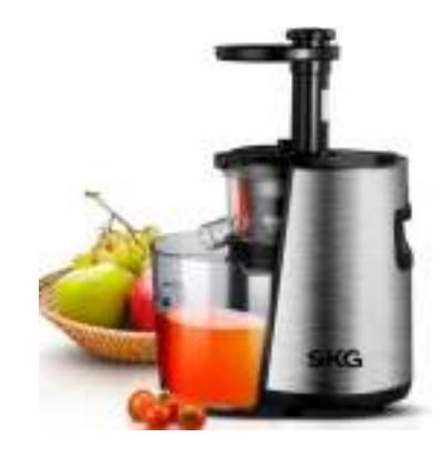
Fig. 2: Juice extractor

let consumers directly eat and the food quality is related to people's health, it should make sure the selected food machinery material is safe when designing (Fu, 2013), as shown in Fig. 1.