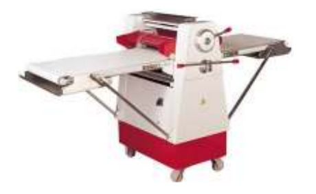
Fig. 3: Vertical dough sheeter