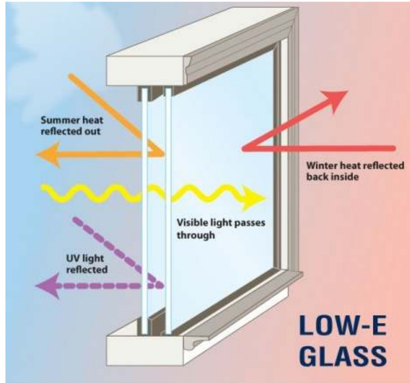
Fig. 2: Cross section of low emissivity window

The cellulose is treated to retard insects and fire; use boric acid treatment only. Using Cellulose insulation makes the home quieter, more comfortable and reduces energy use.