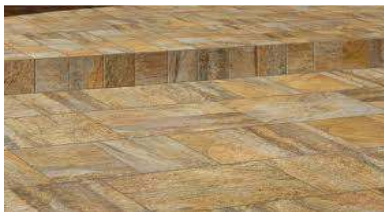
Fig. 5: An example of ceramic tile

buildings for reuse. Many salvaged materials are superior to the products available today such as old-growth non-structural beams, flooring and interior trim. Using salvaged building materials keeps valuable resources out of landfills, reduces pressures on the landfills as well as offering the homeowner inexpensive and unique materials for the home.