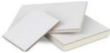
Fig. 3: An example of MDF