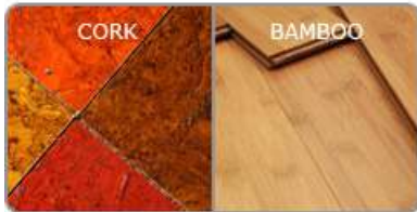
Fig. 4: An example of cork and bamboo flooring