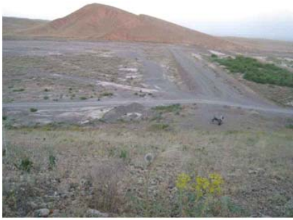
Fig. 1: Part of Shanjan rangeland in Shabestar district, East Azerbaijan province, Iran