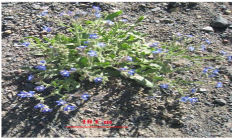
Fig. 2.: Anchusa Italica (Anchusa azurea) species