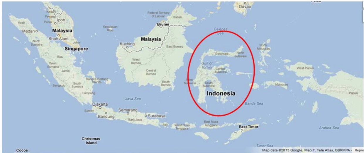
Fig. 1: Sulawesi Island

Sulawesi of the Republic of Indonesia. It can be reached by boat within approximately 30-45 min. Around the island, there is the Bunaken Marine Park which is part of the Bunaken National Park. There are two villages on this island, namely Bunaken with 2,844 inhabitants, which consists of 528 families and Alung Banua with 707 inhabitants from 160 families. Most of them live of farming during the rainy season and