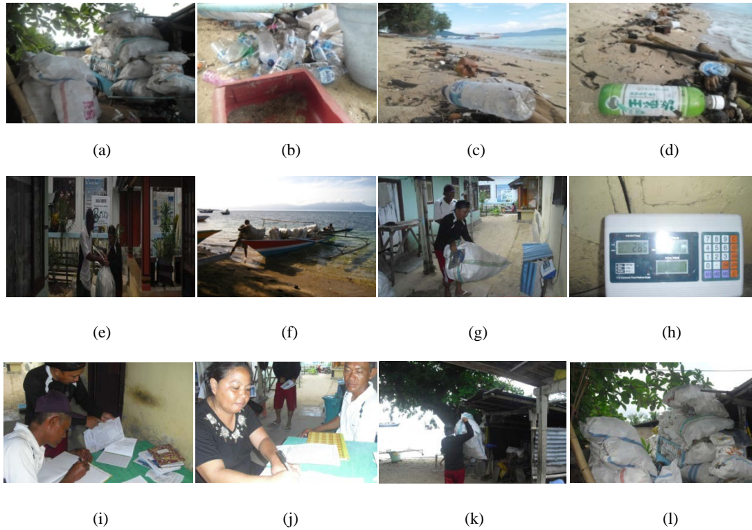
Fig. 4: Community activities together with SHG BRITS in inorganic waste management