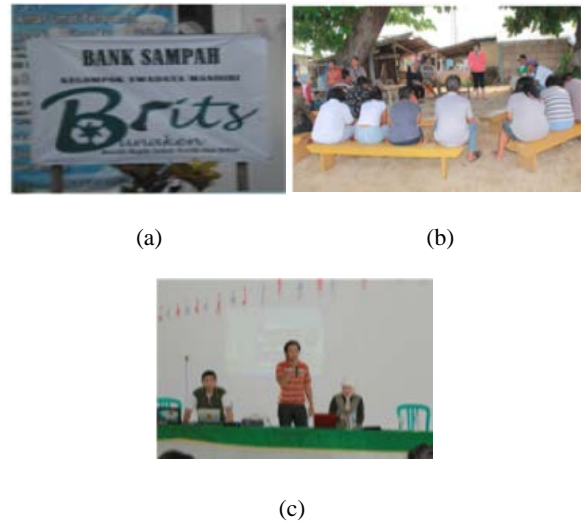
Fig. 3: Making friends with the community through a discussion

The practice of reducing waste by waste management hierarchy methods and intelligent practice replication processes are not easy to do because it will depend on the willingness of people to change their behavior. It requires many direct or indirect efforts such as, among others: the Rubbish Bank pilot program, socialization and education programs, community empowerment and assistance and the educational/environmental campaign.