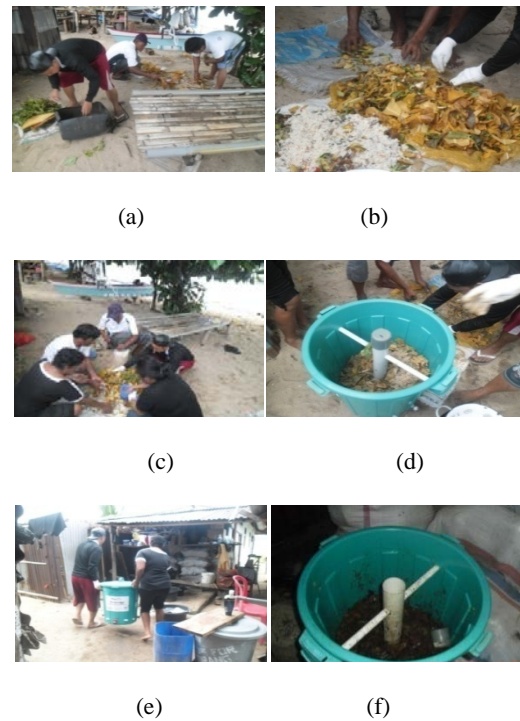
Fig. 5: Organic waste management for composting using BiogrEEen composter