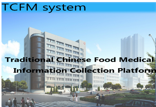
Fig. 2: Screen-shots of mainly interfaces