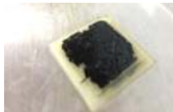
Fig. 1: Charge accumulator systems

The characterization of the components of the energy storage system, as well as of complete system was performed by means of the Cyclic Voltammetry (VC) technique, for it, a potential range of 1.0 to -1.5 V, a scanning rate of 100 mV/sec and 30 voltammetry cycles were used.