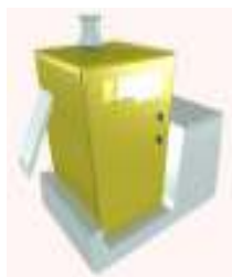
Fig. 1: Appearance modelling