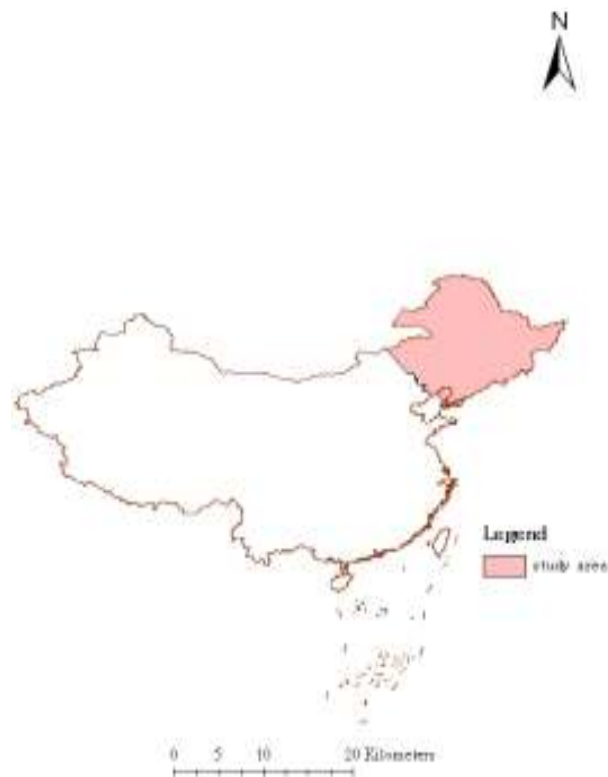
Fig. 1: Study area

To generalize our understanding of the temporal and spatial variability of NEP, NPP and RS at 1 km resolution using IBIS model that was developed and validated for northeastern China forests.