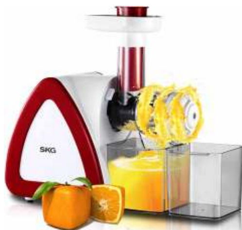
Fig. 2: The shape design of concision

of the multi-function juice extractor, makes its whole good and attains a simple, direct and clear visual effect (Jiang, 2014).