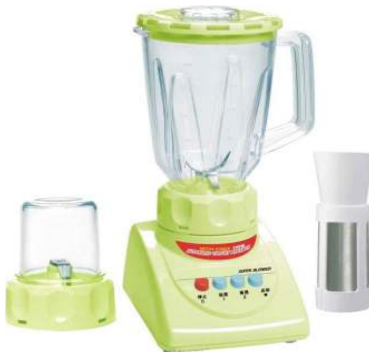
Fig. 1: The shape design of unity