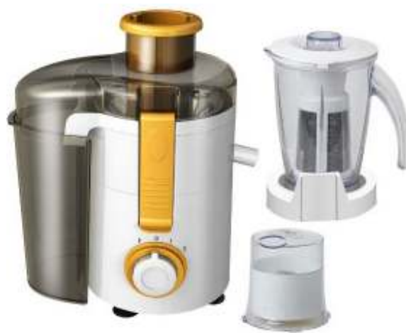
Fig. 4: The color design of multi-function juice extractor matching the new age request of appreciation beauty

Match the new age request of appreciation beauty: With the progress of the age, the improvement of