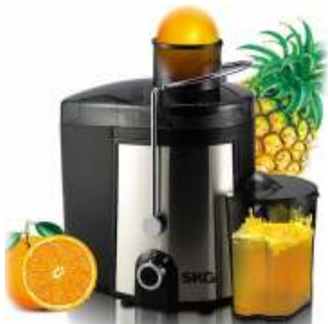
Fig. 3: The color design of multi-function juice extractor satisfying the request of environment and function

vision recognizing degree. The panel should have no strong reflection and dazzle light. The color of display part should be obvious and refreshing, but not dazzle eye. The color of caution part should be fresh and gorgeous to come into notice and the color of concealment part should be quiet, as shown in Fig. 3.