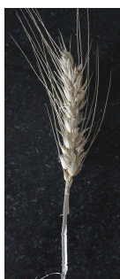
Fig. 3: Breeding wheat ear with tear-petiolate

performance in threshing device. So that to produce congestion easily in threshing device and increase work loads with the cleaning system.