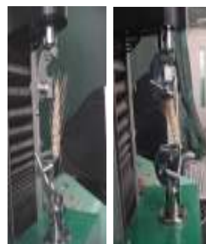
Fig. 5: Tensile trial process of the breeding wheat ear

wheat ear in Gansu agricultural university-New SANS company joint mechanics laboratory and applied the CMT 2502 electronic omnipotent test machine to measure the tensile force of breeding wheat ear (Zhang et al. , 2010).