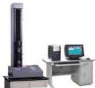
Fig. 4: CMT2502 electronic omnipotent test machine

Equipment and method of test: As shown in Fig. 4, the tensile mechanical properties tests of breeding