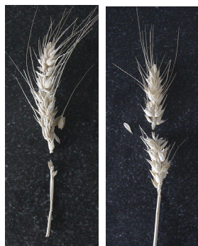
Fig. 2: Different fracture mode in breeding wheat ear