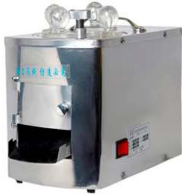
Fig. 1: The color design of food slicer satisfying the request of environment and function