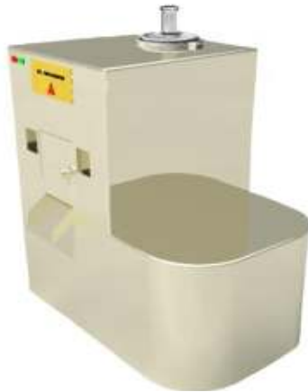
Fig. 2: The color design of food slicer matching the new age request of appreciation beauty