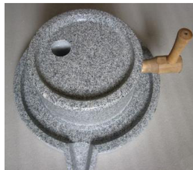
Fig. 1: Traditional stone mill used to make soybean-milk

soaking soybean and grinding soybean, forming the traditional soybean-milk culture (Kang et al. , 2012).