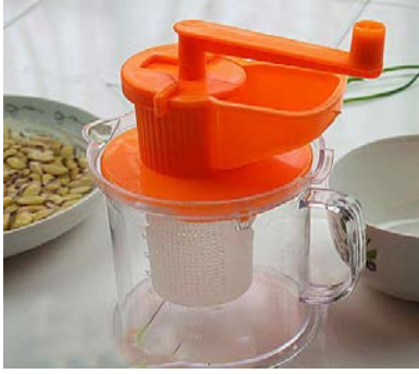
Fig. 2: Hand-operated soybean-milk machine