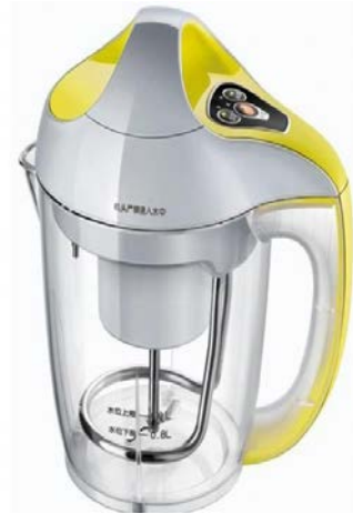
Fig. 8: The color design of soybean-milk machine matching the new age request of appreciation beauty

Moreover, the base, the body and other big pieces of soybean-milk machine are suitable to use a low pure degree color as the main body color and use clear, elegant and clean color to unify overall situation to make the main tone definite. Using little area of high purity color to embellish to make the