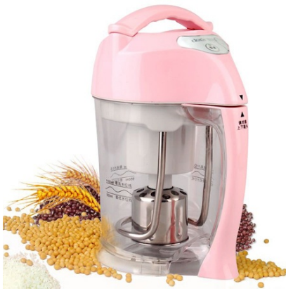
Fig. 6: The shape design of concision

carriage, quality, amount and other aspects. But the variation refers to the difference and the contrast of above-mentioned various aspects. The perfect shape has to emphasize unity. But in order to making the image of the soybean-milk machine different, vivid and attractive, it could add the variety in the same nature of unity, harmony and integrity to strengthen each other contrast, but the variation has to be appropriate, not excessive to avoid huge miscellaneous, chaos and centrifuge, as shown in Fig. 5.