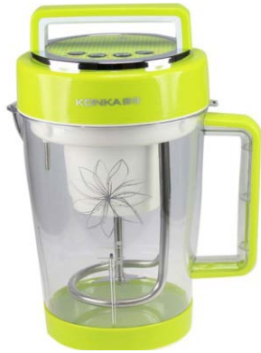
Fig. 5: The shape design of unity