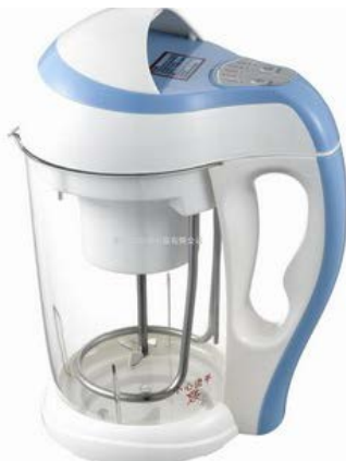
Fig. 4: No mesh soybean-milk machine of the third generation

milk machine of the first generation and the second generation respectively, configures the mesh enclosure of fine mesh and big mesh in the body, as shown in Fig. 3. Because of having the mesh enclosure, some health dead angles that could not be cleaned exist, residue fermenting, so it causes health problems. And that the mesh enclosure needs to be unscrewed to clean, so it is easy to cause aging of thread at lower cover of handpiece and the mesh enclosure to drop. In February 2008, the first domestic soybean-milk machine came out