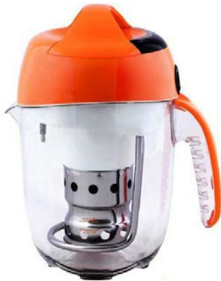
Fig. 3: Big mesh soybean-milk machine of the second generation