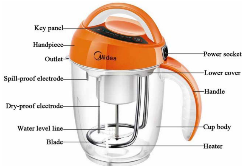
Fig. 9: Structure chart of soybean-milk machine

With the progress of the age, the improvement of people's living standard and the increase of cultural art accomplishment, the appreciating beauty standards also change. In a certain period or a certain region or world scope, some colors are popular with people and are extensively popular, becoming the "popular color". The "popular color" has a strong age characteristic, as a result, in a period, it become the color which is used extensively. The color design of soybean-milk machine also should sufficiently consider using the "popular color" to accord with the age request, as shown in Fig. 8.