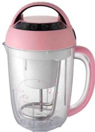
Fig. 7: The color design of soybean-milk machine satisfying the request of environment and function

Contrary, the color matches more much, causing the color more disorderly, so that it is difficult to adjust generally, the main body characteristic is unclear and the harmonious effect is broken.