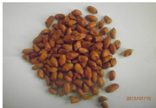
Fig. 1: The manga peanut

Manga groundnut is, in general, good sources of minerals and a diet containing these groundnut seeds will help prevent deficiency of these cations and anions. When we compare the Manga and the neighboring cultivars close to Congo-Brazzaville as Teke and Bembe, we found a slight differences. While the cultivar of Teke known as "mouth peanut" yield only 30.43% of fats, the Bembe cultivar yield 47.47% of fats (Table 2 and Fig. 1).