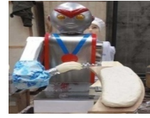
Fig. 1: Sliced noodles robot

Through abstractly simulating the external shape of life body to obtain the appearance characteristics of fun, affinity and humor, such as the cartoon characters of exaggeration, personification, the lovely animals and plants modeling and others; or through choosing the artificiality shape that has the similarity as a mock object to carry through fuzzy design, it could achieve the goal of weakening the functional definition of food machinery.