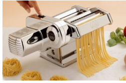
Fig. 4: Noodle maker