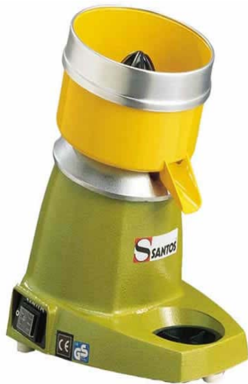
Fig. 6: Orange extractor