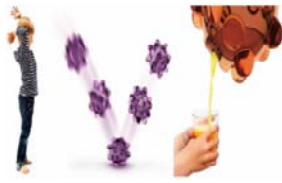
Fig. 8: Smoobo blender

The gamification of food machinery operation: By means of the ingenious structure design or technology application, it could realize the entertainment operation of usage mode. As shown in Fig. 8, the blender, of which the modeling is unique and the color is gorgeous, produces the rebound power by thrown, which prompts cell and rotating blades to operate and complete the mixing operation. Using such an interesting blender lets person fondle admiringly.