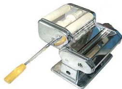
Fig. 7: Hand dumpling machine

regions and different nationalities. It should use the color loved by people and avoid the color forbidden by people, so that the color design of modern food machinery conforms to the people's aesthetic taste, thereby loved by people and expanding market.