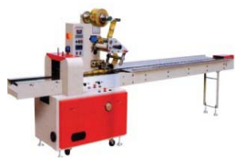
Fig. 3: Automatic inflatable packaging machine

the peculiarity of product. The shape bionics is often used in modern automotive modeling design, such as SEC coupe of Mercedes Benz, Twingo of Renault and perfectly round Mazda 121, all looking like some kind of animal. Viper of Dodge likes a snake of preparing to give you critical strike and Ferrari 275 GTB looks like a cod fish. Food machinery equipment could also refer to some concept of automobile design, making its appearance show a certain style (Qiu, 2005).