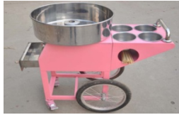
Fig. 5: Cotton candy machine