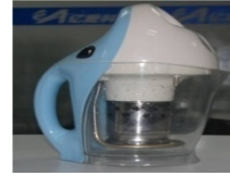
Fig. 2: Soybean milk machine

Depending on the realistic degree of reappearing things, characteristics and features it could be divided into the concrete shape, abstract shape and image shape three kinds.