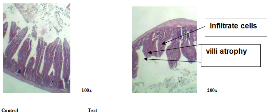
Fig. 3: Showed microscopic examination of intestine

granulocytes) when blood picture was examined which were higher than control after exposure to chitosan, the percentage of (lymphocyte was 530%, monocytes 1237% and granulocytes 250%), this was indicate that A. niger have active charbohydrate in the mycelia. On the other hand there were crossly enlargement in some organs like animals spleen, liver and several payers batches in the small intestine that mean there was immuno reaction on these organs due to the effect of the chitosan.