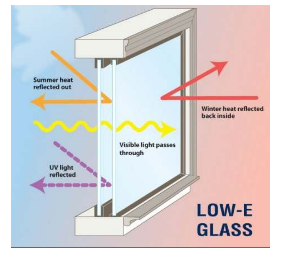
Res. J. App. Sci. Eng. Technol., 10(7): 770-775, 2015