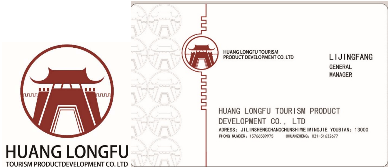
Fig. 3: Brand image design of cultural and creative product of Huanglongfu (Jingfang Li)