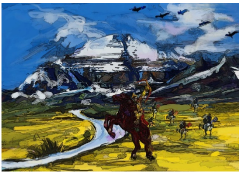
Fig. 2: Shooting swan with arrow of the "spring nabo" of Emperor of Liao Dynasty (Mingzhen Gao)

legends and have no definite written records, could be truly reproduced and the multimedia digital museum including text, voice, image, video and virtual reality could also be set up, for example, according to the legend of magic lamp in Boluo lake to virtually reconstruct Boluo lake and the "seven-color magic lamp" in the lake, as well as creating the "spring nabo" of Emperor of Liao Dynasty to simulate and reproduce the historical scene in those days (Gu, 2005), as shown in Fig. 1 and 2 (Zheng and Xu, 1983).