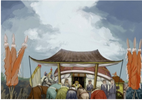
Fig. 1: Appearance of the "spring nabo" of Emperor of Liao Dynasty (created by Haonan Li based on the picture-story book "Fierce Fighting in Huanglongfu" painted by Youwu Xu)