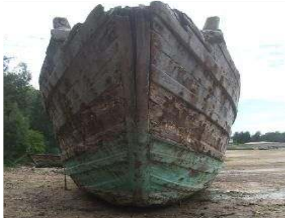
Fig. 2: Abandoned old wooden Ship