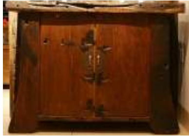
Fig. 9: Copper decorations