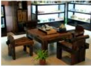
Fig. 1: Old ship-wood furniture