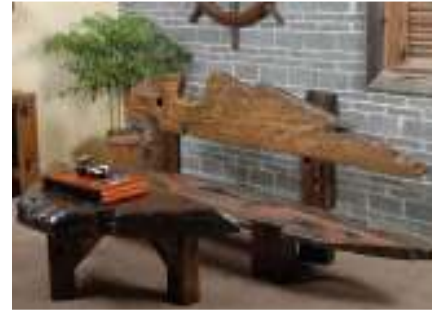
Fig. 3: Old ship-wood yard furniture