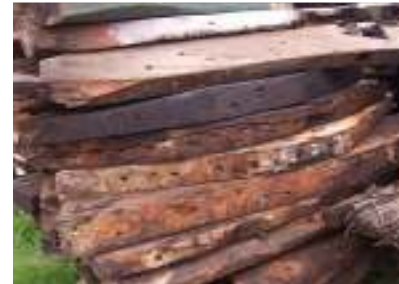
Fig. 8: Classification of the old ship-wood

elm, Merbau, iron Lei, etc. (Fig. 7). The election process of materials for Old ship-wood furniture is complex and exploratory. In the selection process, paying particular attention to observe the morphology of the old ship-wood and conceiving the possible shape characteristics of the old ship-wood furniture so as to the material classification (Fig. 8). After the accomplishment of the materials election, there is no need for anti-corrosion, pest control and other protective treatment. It is only to simply deal with the rivets so that they couldn’t damage manufacture cutting tools in the process of Old ship-wood furniture manufacture.