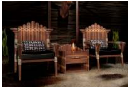
Fig. 10: The structure tied up with strings