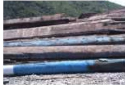
Fig. 7: Logs dismantled from the ship

Choice of materials: The wooden ships can withstand the erosion from the sea and the sea breeze for dozens or even centuries, which have great relationships with materials. Used for large ships, there are many high-quality species, which mostly have high density and hardness, including Queensland Austin, Tokyo, teak,