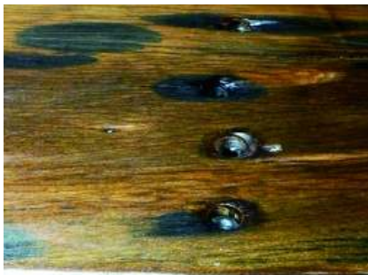
Fig. 6: Unique rivet holes

high value-added old ship-wood furniture through designer's clever conception. It not only keeps in line with the trend of green, but also responds to national initiatives to vigorously promote to construct the "resource-saving, environment-friendly "society and to turn waste into treasure.