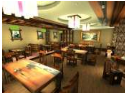
Fig. 4: Old ship-wood dining room furniture

support of the State Science and Technology Commission, the National Natural Science Foundation and other relevant departments conduct a wide range of researches and explorations on green design and manufacture. And the green furniture related researches have been made many achievements, but still cannot meet the needs of green furniture. The green old ship-wood furniture (Fig. 1) is made up of wood materials dismantled down from the discarded old wooden boat (Fig. 2) by simple processing. Its properties of excellent environmental protection, unique original ecology and elegant artistry fit the modern pursuit of the natural way and the concept of life, which is a single show of folk furniture. Therefore, the systematic study on the old ship wood furniture based on the perspective of the Green Environmental Protection can draw people's attention to promote the old ship-wood applied in the field of furniture design and manufacturing, which will ultimately drive forward the development of green furniture.