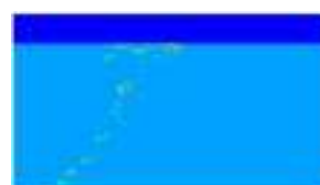
Fig. 8: Distribution of oil-water-gas (t = 60s, u = 0.1m/s, P = 100800pa)