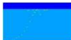
Fig. 9: Distribution of oil-water-gas (t = 80s, u = 0.1m/s, P = 100600pa)