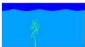
Fig. 14: Distribution of oil-water-gas (t = 10s, u = 0.1m/s, k = 1, P = 104000pa)