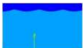
Fig. 13: Distribution of oil-water-gas (t = 24s, u = 0.1m/s, k = 1, P = 104000pa)