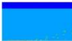
Fig. 11: Distribution of oil-water-gas (t = 80s, u = 0.5m/s, P = 101000pa)

different oil spill trajectory, when the other conditions are fixed. When operating pressure is high enough, the