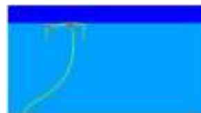
Fig. 6: Distribution of oil-water-gas (t = 38s, u = 0.1m/s, P = 102000pa)

According to the analysis above, the conclusion can be drawn that different operating pressure can cause