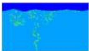
Fig. 16: Distribution of oil-water-gas (t = 30s, u = 0.1m/s, k = 1, P = 104000pa)

sea current has little influence on oil spill and we can control and reclaim oil spill more easily. However, when the operating pressure is low, the stretched extent underwater and oil films area on surface increase, which is difficult for the spilled oil to be controlled.