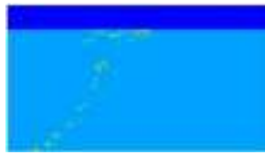
Fig. 4: Distribution of oil-water-gas (t = 80s, u = 0.1m/s, P = 100800pa)