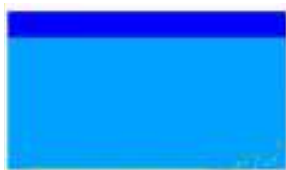
Fig. 12: Distribution of oil-water-gas (t = 80s, u = 0.8m/s, P = 101000pa)