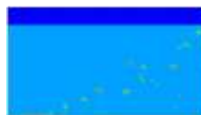
Fig. 10: Distribution of oil-water-gas (t = 80s, u = 0.3m/s, P = 101000pa)