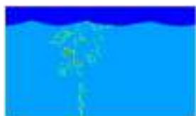
Fig. 15: Distribution of oil-water-gas (t = 20s, u = 0.1m/s, k = 1, P = 104000pa)