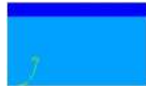
Fig. 3: Distribution of oil-water-gas (t = 24s, u = 0.1m/s, P = 100800pa)