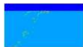
Fig. 7: Distribution of oil-water-gas (t = 56s, u = 0.1m/s, P = 101000pa)