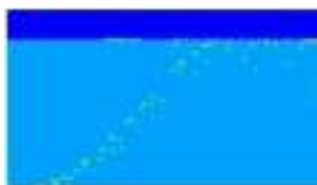
Fig. 5: Distribution of oil-water-gas (t = 140s, u = 0.1m/s, P = 100800pa)

The length and damping section of water flume are 60 and 8 m, respectively, while water depth is 10 m. The source term, the initial conditions and boundary conditions are defined by the macro of DEFINE-SOURCE (mom-source, cell, thread, dS, eqn), DEFINE-INIT (my-init-phase, mixture-domain) and DEFINE-PROFILE (inlet-x-velocity, thread, position), respectively. The result of simulation is shown in Fig. 2.