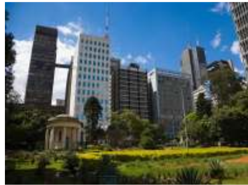
Fig. 4: Lawn garden, US http://home.howstuffworks.com/lawn-garden/professional-landscaping/basics/urban-landscape-design.html

The second part is instruction and housing. These are covering the impact of construction housing and keeping material and all of facilities and services which