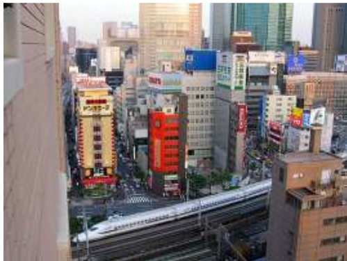
Fig. 3: Transportation in Curitiba, Brazil

2008). Figure 3 is a sample of transportation in sustainable town in Brazil.