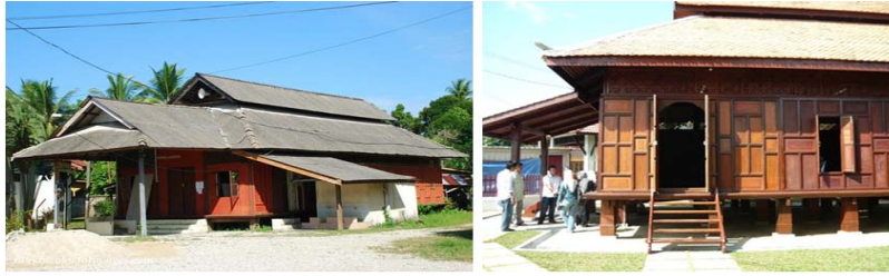
Fig. 1: Masjid lama Mulong, before (in 2008) and after (in 2009) the conservation program (Johar, 2012)

Before the restoration works, the building served as a mosque to the community and once to be as an academic institutions (Fig. 1). It no longer used to hold for the Friday prayer since a bigger mosque is built nearby. With the conservation program, the poor state condition of the building is repaired and history maintained and continuously to serve to the community as another house of worship and educational institutions to the community.