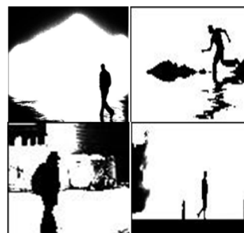
Fig. 4: I1, I2, I3 and I4 output of the proposed architecture- pedestrian and object segmentation