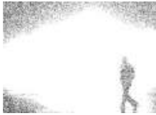
Fig. 2: Output-spatial DRD filter