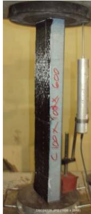
Fig. 1: Test setup

To understand the axial compression load capacity of cold formed lipped channel section strengthened with CFRP, a two phase experimental programmer was conducted. In Phase 1, a total of 18 specimens of plain cold formed steel sections were tested. In Phase 2, a