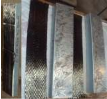
Fig. 2: Surface preparation and application of CFRP

modulus epoxy adhesive MC-Bauchemie was smeared uniformly on the surface of the fibre sheet. Unidirectional high-strength carbon fibre sheets namely MBrace CF 130 of 3790 MPa ultimate tensile strength 230Gpa elastic modulus with a thickness of 0.176 mm were used in this investigation. The composite sheet was then placed around the exposed external surface of the column web and gradually pressed along the fibre axis.