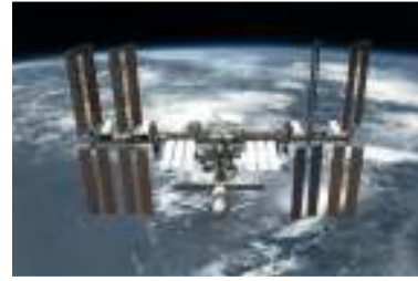
Fig. 1: A photograph of the international space station

The ISS is undoubtedly and particularly well suited as a reference for developing a deep-sea space station. The ISS (Fig. 1) was intended to be a laboratory, observatory and factory in space. It was also planned to provide transportation, maintenance and act as a staging base for possible future missions to the Moon, Mars and asteroids (NASA Report, 2009). Recently, the ISS was given additional roles of serving commercial, diplomatic and educational purposes. The ISS is the largest, most complex international scientific project in human history and our largest adventure into space to