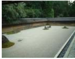
Fig. 8: Dull landscape in Ryoanji