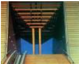
Fig. 10: Japan pavilion designed by Tadao Ando