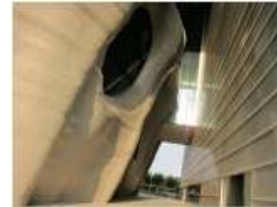
Fig. 5: Shanghai Zendai Himalayan art center

imagination. A building can have many possibilities resulting from different persons' different feelings on space out of their personal experience, knowledge and memory. Everyone knows "ma" as a feeling and experience, but no one can express and explain it in language or theories, which just is Arata Isozaki's "ma" space theory.