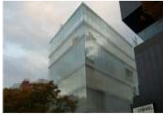
Fig. 3: DIOR omotesando

Kazuyo Sejima and Ryue Nishizawa both have shown this idea. In 21st Century Museum of Contemporary Art, the two architects chose 360-degree transparent and open glass curtain walls, making the shape extremely slight. While DIOR Omotesando used the form of veiling to express this idea. It is a seven-floor cuboid building, with glass as its outside walls attached with transparent propylene panels, which were processed to as its outside wall materials in folding shape so as to utilize the irradiation of lights and enable the visitors to see a building as if it is enwrapped by gauzes. The glass curtain walls on its surface were layered with wire lines, but they give peoples a feeling of homogeneity and smoothness under the influence of sunshine, environment and so on factors and makes the building look light and floating, transparent and flowing as a crystal cube, as shown in Fig. 3. Kazuyo Sejima and Ryue Nishizawa have annotated the fine structure of Japanese architecture.