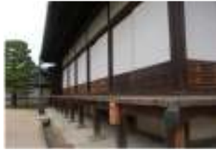
Fig. 6: Transitional space of Nijocastle