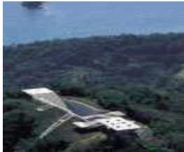
Fig. 9: Kiro-san observatory