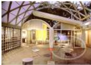
Fig. 7: The silvery cottage

guestrooms is on the platform of over thirty meter height, the artistic pictographs on the bottom out wall are embedded into the grids, such a design expresses the tradition in an abstract way and makes the space with sense of shadow. The art center is divided into two extremely different parts: the glittering and translucent cubic and natural and organic anomalous part. Furthermore, their space conditions are different too, one is a public commercial space and the other is a closed office space, the place blending the two parts is Arata Isozaki's "ma" space theory, because the comparison space with vividly different features is its expression.