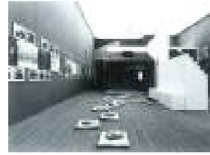
Fig. 4: Exhibition of "Ma-Time and Space of Japan."

As a student of and being affected by Kenzo Tange, Arata Isozaki has strong interest in traditional Japanese architectural space and has committed himself in the exploration. He uses Japanese traditional mean of black and shadowy space to achieve the distance sense between humans and buildings and make observers incompletely know about them so as to fully exert their