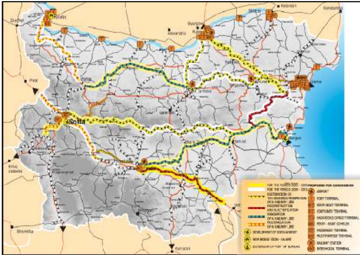
Fig. 3: Prioritizing projects for modernization of the railway infrastructure (Ministry of Transport, Information and Communication Technologies of the Republic of Bulgaria, 2006)

energy supply of Europe (Ministry of Economy, Energy and Tourism of the Republic of Bulgaria, 2011).