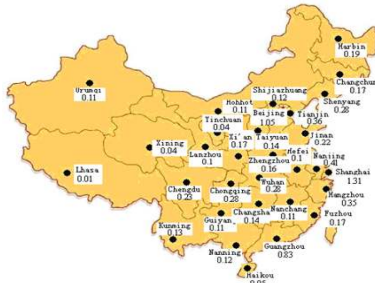
Fig. 3: The value loss of 31 Chinese capital cities due to traffic noise in 2011 (Units: 0.1 billion yuan)

Figure 3 shows the loss of urban road traffic noise of 31 Chinese key cities in 2011. It can be seen from Fig. 3 that: the loss of urban road traffic noise of coastal areas in the east and central parts of the city is significantly higher, while that of the western region is relatively lower. The reason is that the cities of coastal areas in the east and central parts own relatively large population, high per capita disposable income, while the cities of the western region have relatively small population, low per capita disposable income.