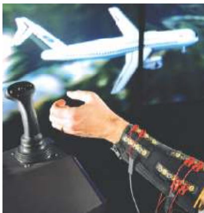
Fig. 4: Flight control using EMG technology; Vince Stanford, "biosignals offer potential for direct interfaces and health monitoring"

manipulate control inputs. A space-based application could let astronauts' type into a computer despite being restricted by a spacesuit. If a depressurization accident occurred on a long-term space mission and astronauts needed to access onboard computers, they could use EMG electrodes in their spacesuits to replicate a computer interface.