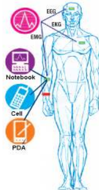
Fig. 2: EMG as a subtle input interface for mobile computing; Vince Stanford, "biosignals offer potential for direct interfaces and health Monitoring

require a certain level of attention). Events such as a new message or phone calls generate cues. The user can react to cues by contracting the muscle, for example requesting more information about the event such as the message subject or the caller ID. The peripheral cues can otherwise be ignored, if the user cannot afford to give attention to the computer. Using EMG, the user can react to the cues in a subtle way, without disrupting their environment and without using their hands on the interface. Figure 2 shows EMG as a subtle input interface for mobile computing.