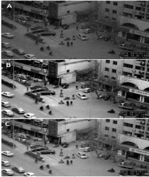
Fig. 2: Image denoising effect