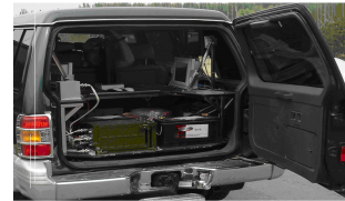
Fig. 2: Experiment of transfer alignment mounted vehicle