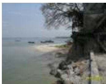
Fig. 3: Location 2-north of Tg. Tokong