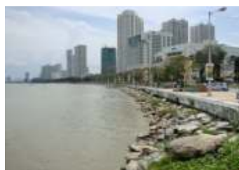
Fig. 4: Location 3-beachfront of Gurney drive

Besides that, the pH value for Sg. Fetes was 6.91; North Tanjung Tokong and Gurney Drive have higher pH value which was 8.0 and 7.48, respectively. Most water bodies have pH range of 6 to 8. If the pH falls below 6, it has harmful effects for the ecological (Lenntech, 2012). Extreme pH can kill adult fish and invertebrate life directly and can also damage developing fish. When the pH of freshwater becomes highly alkaline, the effects to marine life include death and damage to outer surfaces.