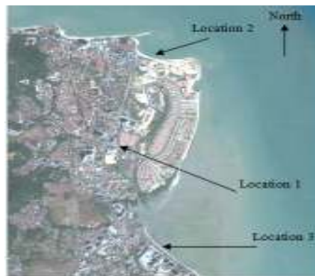
Fig. 1: Sampling locations (based map sourced from Google earth)

Samples collection and preservation: The water samples from each location are collected using 20 L bottles and stored inside cool room at temperature of