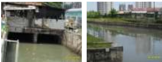
Fig. 2: Location 1-Sg. Fetes downstream