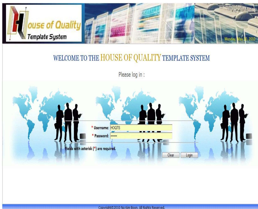
Fig. 3: Log in interface

As presented in the flow chart, the application presents a simple function of HoQ. The reason is due to the main problem of using HoQ i.e., in managing and analyzing large relationship matrices (Boonyanuwat et al. , 2008). Therefore the application involves both limited numbers of customer requirements and limited numbers of technical elements. A big project might be reduced into a set of sub-projects, so that the relationship matrices could be simplified and analyzed thoroughly.