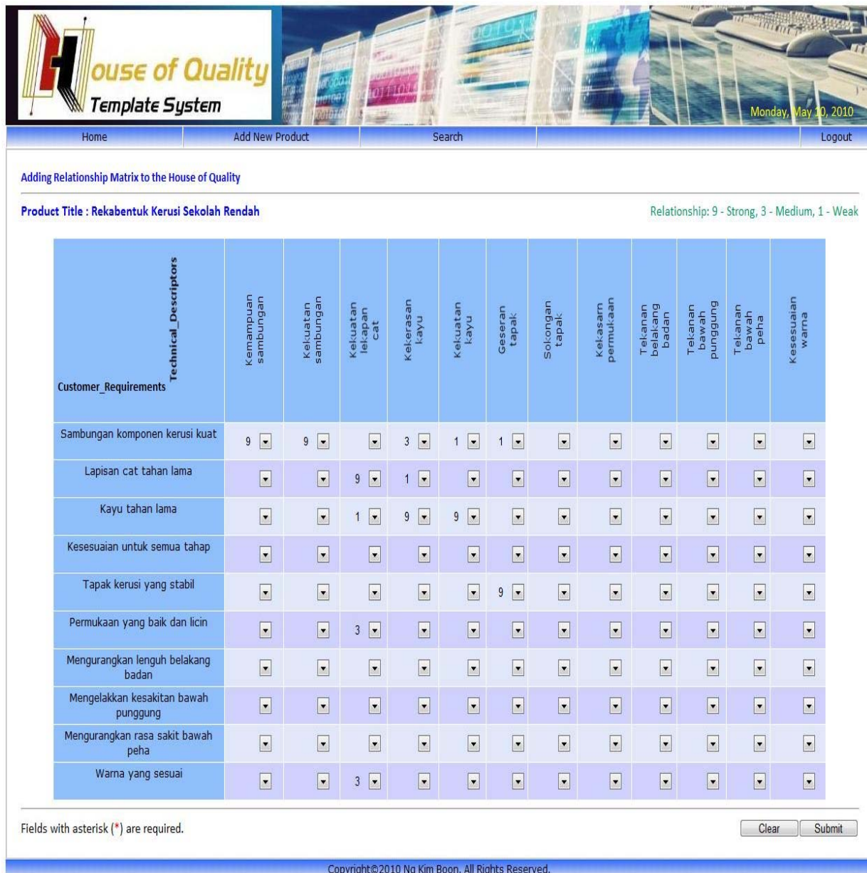
Fig. 7: Correlation matrix

customer requirements and technical attributes. The relationship matrix is presented in an interface in Fig. 7. This function enables users to determine the interaction matrix of the products or services. It is used to show how much the product features given by the engineering characteristics might affect the individual customer needs.