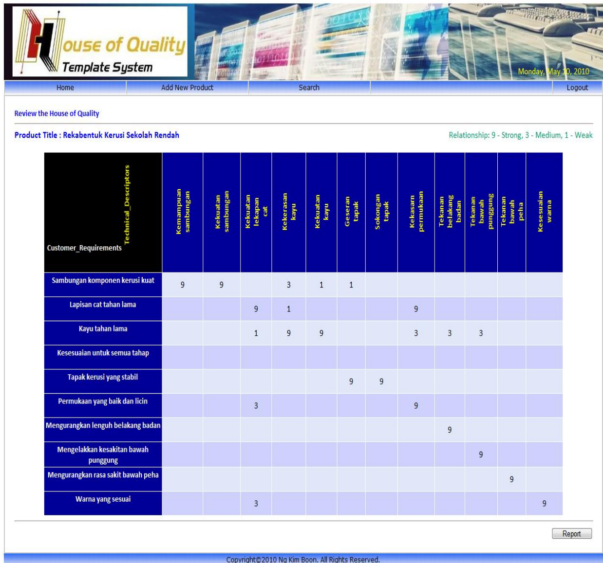
Fig. 8: House of quality review