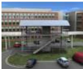
Fig. 1: Personal Rapid Transit (PRT) station