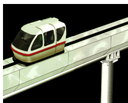
Fig. 2: Personal Rapid Transit (PRT) guide way

enough efficient to attract the citizens and therefore unlimited use of private cars and automobile dependency still remains as a major and serious problem in urban areas. It seems that cities and metropolises should look for other types of public transport in order to reduce the adverse impacts on communities. Personal Rapid Transit well known as PRT is a system which can be considered as an alternative in urban transportation.