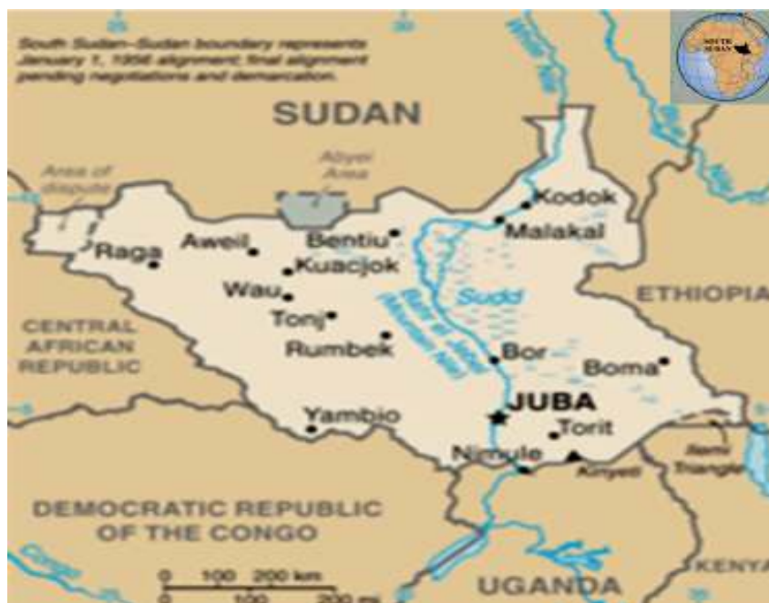
Fig. 1: Map of south Sudan showing the location of Juba

stagnant water, water pollution, breeding of insect and rodent vectors and the spreading of diseases (Cointreau, 1982; Zurbrugg, 2002b). Most wastes are disposed of in open dumps, deposited on vacant land, or burned by residents in their backyards (Medina, 2010; Visvanathan and Glawe, 2006). The current practices of collecting, processing and disposing of municipal solid wastes are also considered to be insufficient in the developing countries. The typical problems are low collection coverage and irregular collection services, crude open dumping and burning without air and water pollution control, the breeding of flies and vermin; and the handling and control of informal waste picking or scavenging activities (Bartone, 2000).