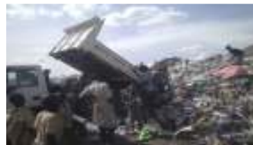
Fig. 5: People scavenging at the dumping site

The dumping site: The dumping site is located about 16 km away from the city along the Juba-Yei road. It is