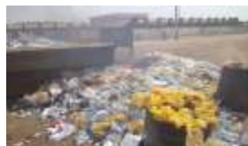
Fig. 3: Municipal solid waste management practices in Juba University's campus

Municipal solid waste collection in Juba: In Juba, the collection of the waste is a kind of a joint venture which includes the Juba city council authorities and a private company applying the door-to-door system. In this system waste pickers collect garbage from shops and streets and load it on a lorry (usually a tipper truck) as there are still no waste compactors trucks. Unfortunately, these pickers lack all the necessary appropriate equipment except having only rakes, spades and bags. Their working conditions are generally unhygienic; implying that there is high health risk. The famous and the only company involved is the Southern Express Company. This company is only responsible for the collection of waste of Juba district ( payam ) whereas the other two districts ( payams ) (Kator and Munuki) are the responsibility of the city council. One big problem with this company is that, it is very