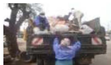
Fig. 4: The municipal solid waste collection process (photo by the author during the observation period)

selective in providing the services. For example, the areas that it regularly serves are Juba Market, Riverside (where most of the hotels are), Hai Malakal, custom Street, Juba na Bari and some other areas where NGOs, UN agencies and Ministries are located. The residents of these areas are mostly the upper class citizens. Surprisingly, all the mentioned areas comprise only 10% of the entire Juba district ( payam ). One can imagine how the 90% of the payam manages its waste.