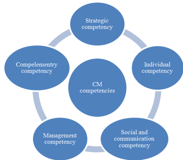
Fig. 1: Competencies categories

Situational approach is the last approach. This approach is not similar to the two other approaches. As researchers argue, organizations are usually influenced by situational as well as environmental elements. Situational approach discusses that all managers should possess some common competencies. Yet the kind of the competencies and the degree of their significance vary due to the variety of the nature of different organizations and the dissimilarity in jobs because these differences determine situational factors. It is cultural and environmental alterations, the features of work and the era of the society that determine the necessary competencies related to situational approach. The question addressed by this approach is: “In the present situation, which competencies are required to help organizations accomplish their strategic goals?” Every one of the three above mentioned approaches will be elaborated in the following subsections (Koenigsfeld et al. , 2012).