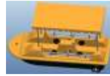
Fig. 1: Three-dimensional modeling of the amphibious ship for sightseeing amusement

Confirm the overall design scheme: Through demonstration and simulation calculation, the author makes scheme screening to select the excellent one and finally determines the overall design scheme that the rudder is arranged front and the pedal drive is arranged