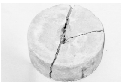
Fig. 2: Failure pattern of plain concrete