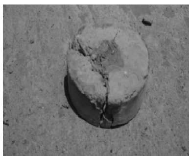
Fig. 3: Failure pattern of steel fibre concrete

With fiber reinforced concrete specimens the pieces were not often broken clearly, whereas in plain concrete specimens were clearly broken.