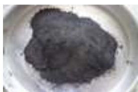
Fig. 3: Palm oil fuel ash collected from the palm oil mill