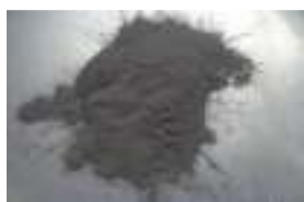
Fig. 4: Processed palm oil fuel ash

lightweight aggregate concrete were investigated through experimental study.