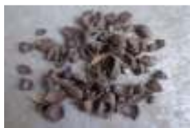
Fig. 1: Oil palm shell collected from the factory