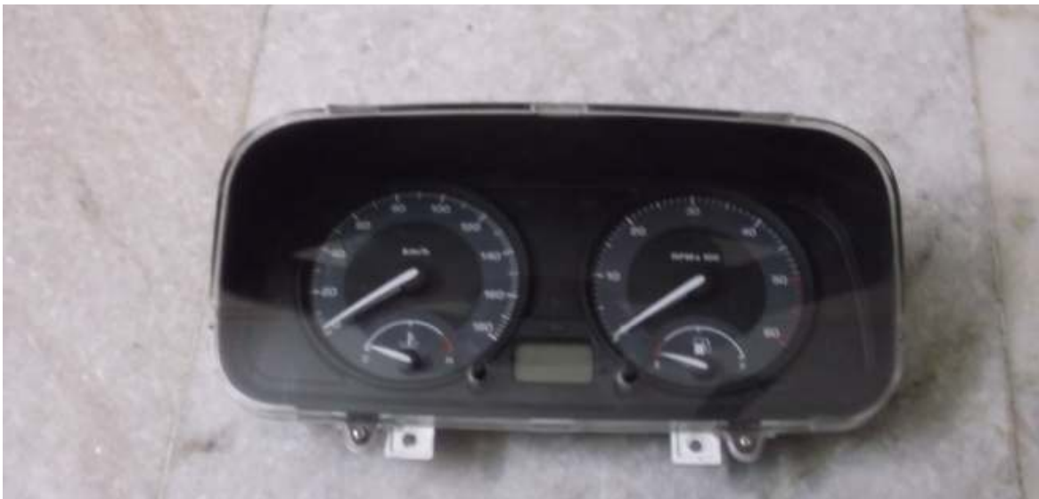
Fig. 1: Automobile instrument cluster

Kilbridge wester heuristic approach: The procedure for solving Assembly line balancing problem is as follows: