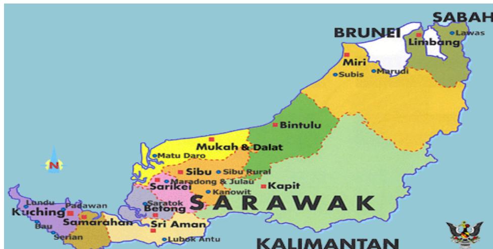
Fig. 1: Area by districts in Sarawak (Sham, 2012)