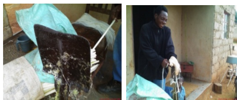
Fig. 1: The crude extraction tool (spade) and a man using the tool for fibre extraction