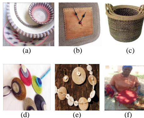
Fig. 3: Products made by respondents, a) sisal bowls, b) wall watch made of sisal and wood, c) Sisal baskets, d) and e) sisal jewelry (earrings and necklaces) and f) one of the respondents making a table mat

All the respondents reported that it took one week maximum storage time before extraction, after which extraction became hard as sisal started drying out. After extraction the respondents said they dried the fibres