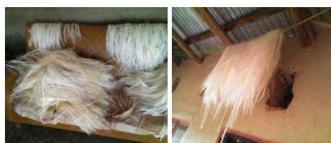
Fig. 2: Pictures showing sisal fibres being dried inside a house and under shelter to avoid change of colour

both cattle and goats. A small portion (8%) of the households was considered rich, because they had over 20 cattle. The livelihood asset that was found to be in abundance was chicken. Most of the respondents kept them, with an exception of 16% of the households. Seventeen per cent of the respondents' households had over 20 chickens (Table 5).