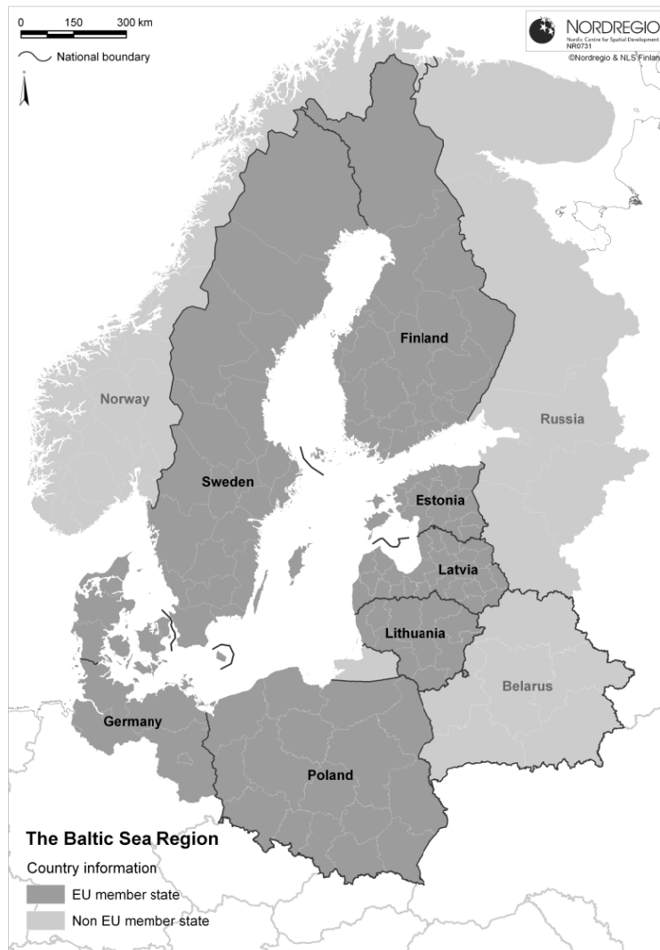
Fig. 1: The Baltic Sea region