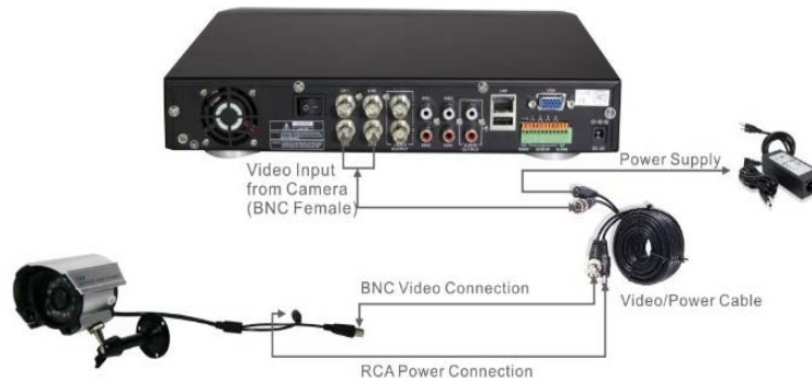
Fig. 1: Simple CCTV with Wire System (Kim, 2009)